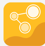
Image-supported | Touch/scanning | Windows/iPadOS compatible | Designed for tablets

An instant scene-based language learning app that turns everyday moments into learning opportunities.